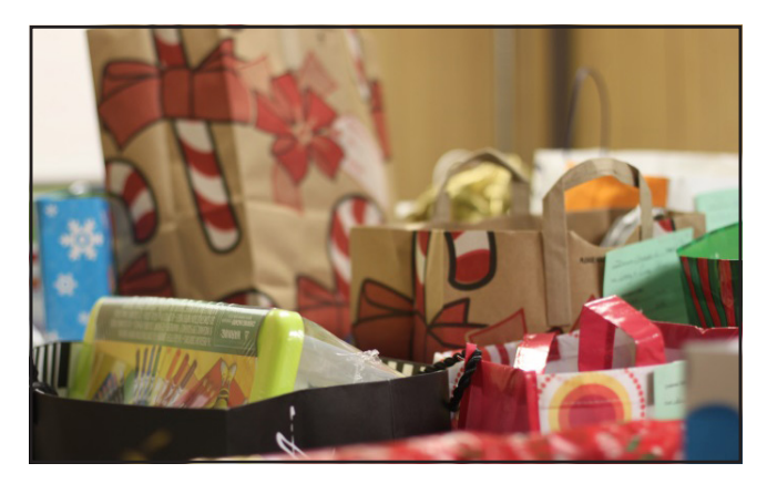
Merry Christmas Indeed! Each fall our phones start ringing from congregations who want to "adopt" a resident for Christmas. Over 150 Christmases are made merry through the generosity of our faithful friends.

Today, scores of congregations each use their unique gifts and talents to further the mission of Luther Home of Mercy. Over 100 churches have joined us as members of our Association of Congregations and faithful volunteers have served so diligently as board leadership. From flipping pancakes at church suppers and sending us the proceeds to rolling up shirt sleeves to aid with landscaping, each gift enables us to provide quality care in a Christ centered atmosphere. As we celebrate our 90th anniversary, we are ever so thankful for the faith and trust that congregations have invested in our ministry and look forward to many more decades of continued partnership as a community of Christ.