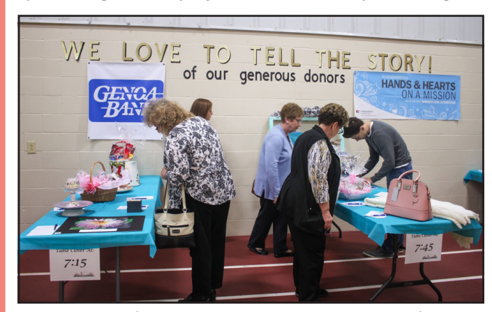
Lots to choose from: Shoppers browsed a selection of over 60 silent auction items.

hat a night! We are so thankful to all of our friends who helped make our 90th Anniversary Auction & Dinner an evening to remember. It was a wonderful night of mouthwatering food, lively entertainment and sharing our story of 90 years of ministry. Special thanks to Genoa Bank for sponsoring the meal, Thrivent Action Teams for sponsoring various projects, and the many donors, guests and volunteers who helped make this event happen!