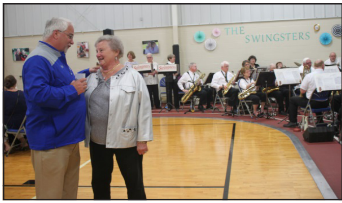
Friends gathered to enjoy a time of fellowship while the Swingsters serenaded the crowd with big band hits.