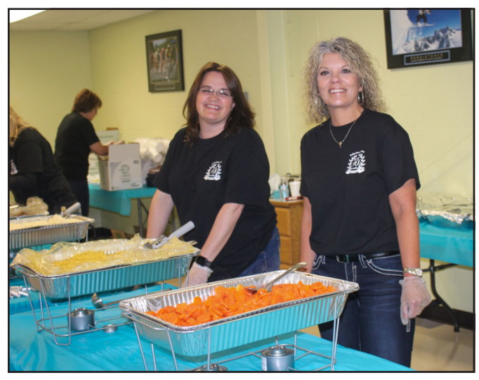
Volunteers served up delicious dinners prepared by Ole' Zim's Wagon Shed. Their famous chicken was a crowd favorite!