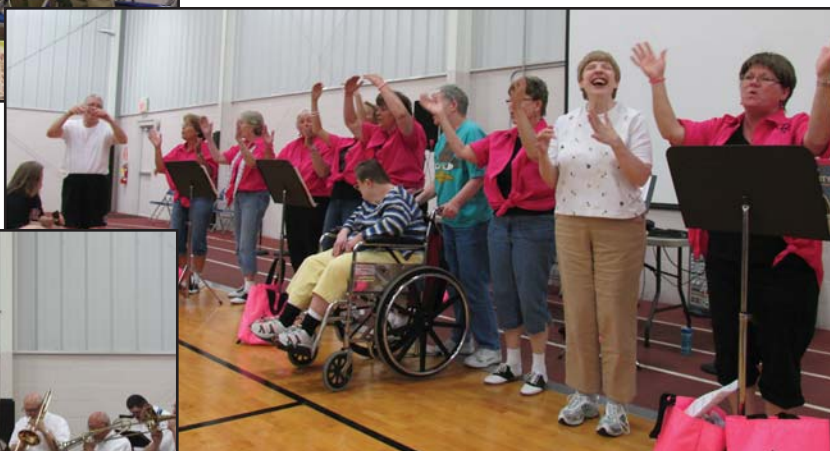
The "Hot Flashes" from Pemberville had everyone clapping and singing along to music from the 50's & 60's.