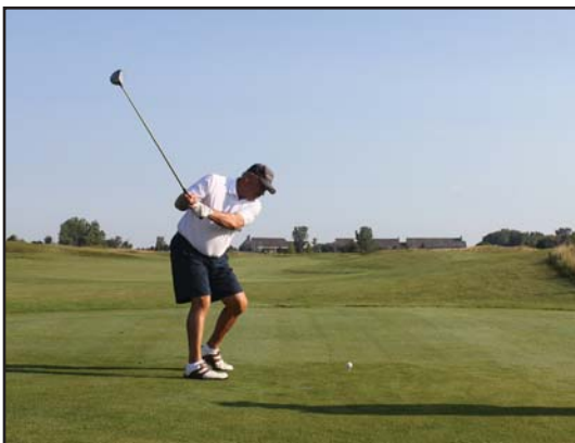
Maumee Bay was a challenging course for the golfers at the LHM Golf Outing.

The 17th annual Four Lutheran Agency Golf Outing was held on Friday, July 12, at Stone Ridge Golf Club in Bowling Green. It was a gorgeous summer day for the sixty-eight golfers who teed off in the morning. The support of all the Sponsors and Donors was very much appreciated. Thanks once again to members of the Thrivent Financial Toledo Area Associates for sponsoring the putting contest. The day concluded with a delicious lunch and awards in the clubhouse. Funds raised from this outing will help to purchase an adaptive van at Filling Homes, lend a hand to elderly persons who are short on funds at Lutheran Homes Society, help to furnish new homes being built in the community for Luther Home, and provide funds for the Toledo Emergency Food Pantry at Lutheran Social Services of NW Ohio.