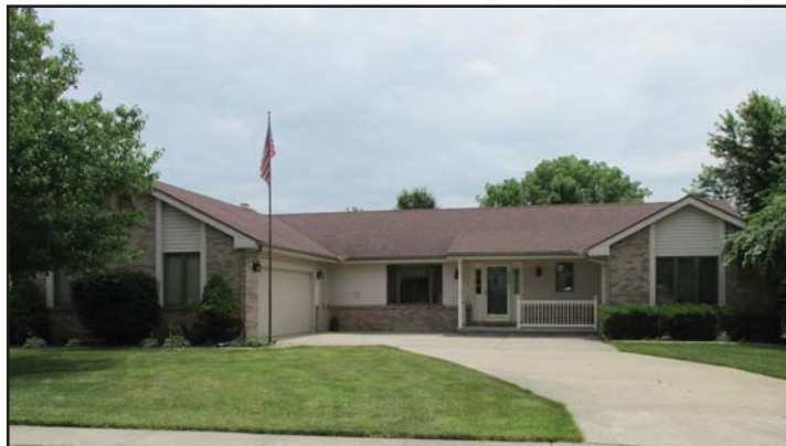
This lovely home on Seaman Street in Oregon was purchased recently and will provide a home for three of our clients.