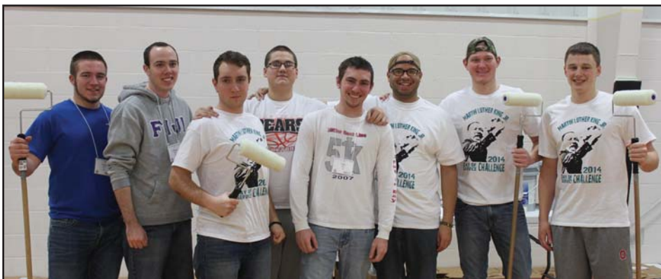
These students from BGSU did a great job painting our gym and exercise area during their Martin Luther King Jr. Day of Service.