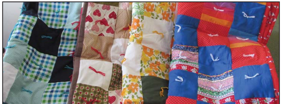
This is just a sample of the beautiful handmade blankets that were donated by the Ladies Sewing Group from Memorial Lutheran Church in Toledo.