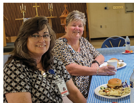
LMM & Luther Home staff enjoyed a potluck and were invited to support the LSS Pantry by donating items or money.

As an affiliate of Lutheran Ministries of Mercy, we are blessed to have partners who have become trusted friends. Together, we are proud to offer vital ministries that make a difference!