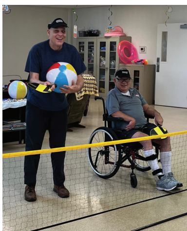
Pickleball at Advent Lutheran Center Day Program was a big hit!

ConocoPhillips Company Owner Relations Unit Bartlesville, OK Ecolab TX Thrivent Choice Minneapolis, MN