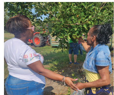
Advent Day Program participants had fun picking apples & learning about them.

Thank you for your support in our safety BWC!