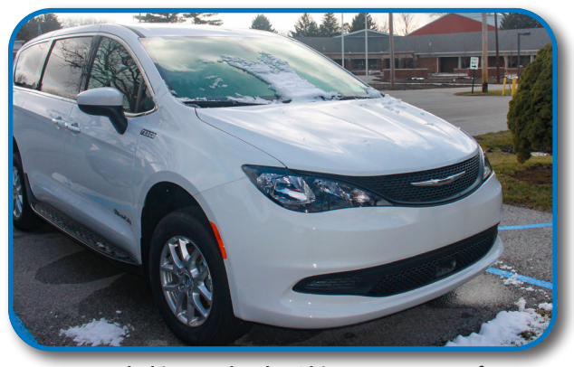
Funded in part by the Ohio Department of Transportation, the new vehicle offers foldable seats and ramp entry making it ideal for a variety of passengers.

In addition to Committee participation, Luther Home continues to utilize resources from the Ohio Department of Transportation Specialized Transportation Program. Since the early 2000's, Program funding has offered significant assistance to LHM for the purchase of multiple campus buses and vehicles. Recently, Luther Home was awarded a brand new minivan to be used for resident outings. We look forward to expanding opportunities for shopping trips, dinner out and a chance to go to the movies. Though there is still much work to do, we are thankful for these valued partnerships that help our residents ride in style!