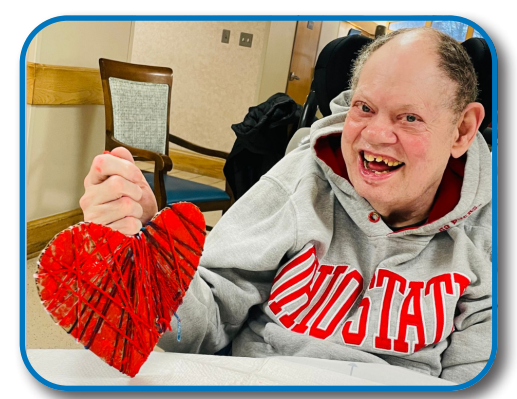
The Story of Lutheran Ministries of Mercy is a story of love.