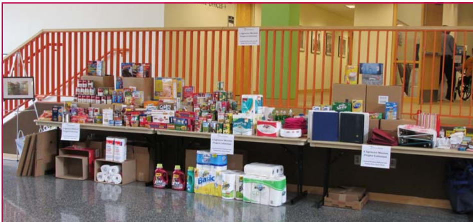
Thanks to the delegates to the NW Ohio ELCA Synod Assembly who donated these needed items for the Four Lutheran Agencies.