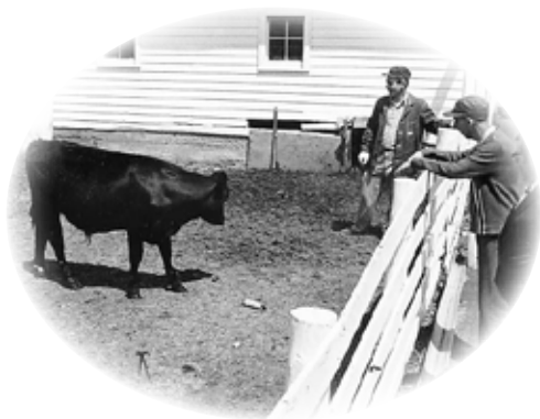
Livestock was once raised on campus.

The Lord has blessed us with a mission together with resources necessary to accomplishment. He has provided the most devoted of caregivers, the most gracious Church and Community friends, the most giving Volunteers – all working together to make life just a little better for neighbors with special needs. Thanks be to God for the continuing ministry of Luther Home of Mercy!