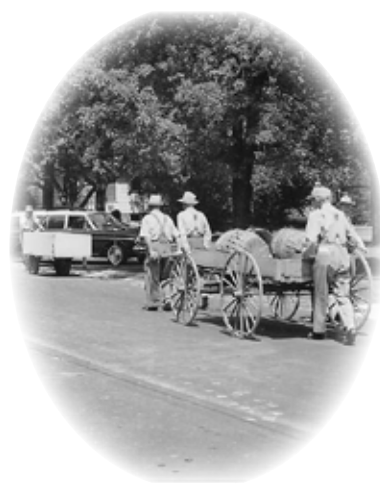
Transporting items on campus...