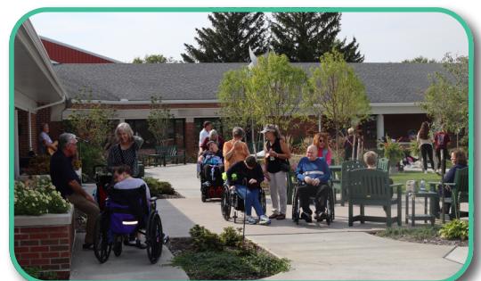
A stroll through the brand-new Garden of Compassion was a highlight of the afternoon.