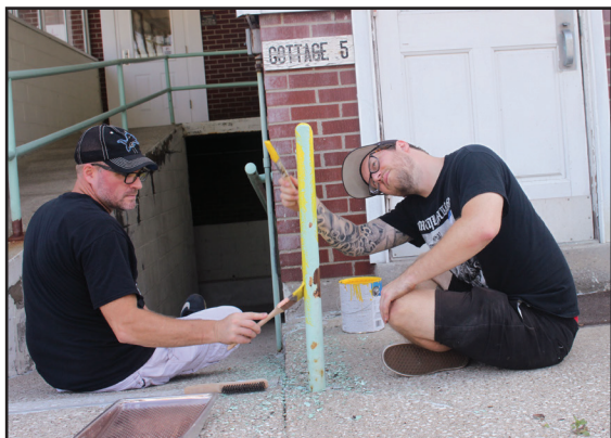
Volunteers made short work out of painting the interior and railing of the former administration building. This building will soon be used to house LHM's Community Ministries management staff.

Since the last Jeep Cherokee was built on April 6, 2017, the Fiat Chrysler Automobiles US Toledo North Assembly Plant has been retooling its infrastructure in preparation for the next generation Jeep Wrangler. In conjunction with returning to work, several thousand plant employees helped Toledo-area community organizations “retool” by volunteering during a six-week program known as Season of Service. This fall, Luther Home was pleased to welcome three groups from Jeep who helped paint our former administration building, spruced landscaping at the Emmaus Community Center and joined clients for an animated game of bingo. We are tremendously grateful for this gift of support to our community!