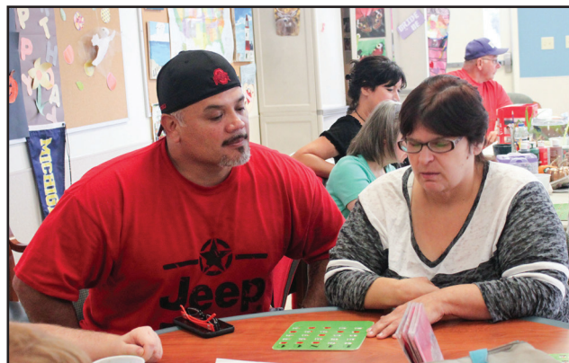
Bingo was the name of the game when Jeep volunteers took part in an afternoon of fun at Emmaus.