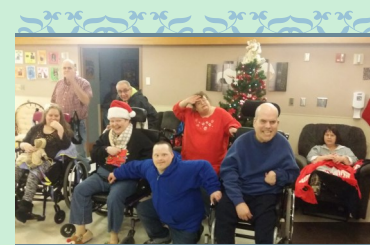
Cottage 10 residents on Christmas Day.

Thanks to the many individuals and groups that donated gifts to our Adopt-A-Resident program. We had a very blessed Christmas here at Luther Home of Mercy. All of our residents on campus were adopted and many of our outreach clients also received presents through this program. Approximately 700 gifts were donated to our ministry this past year. We want to thank you for your kind and generous donations and for making Christmas special for the individuals we serve.